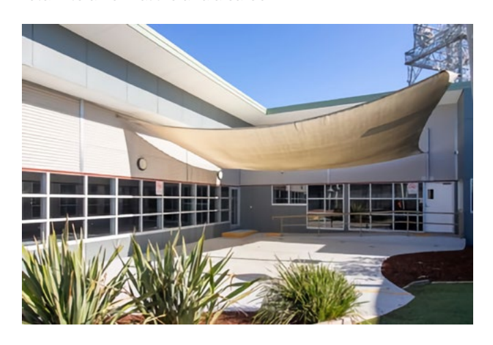
The Maribyrnong Community Residential Facility supports men who are exiting prison to find stable housing and employment prior to reentering the community

"They have not only provided me the environment to recover, but also enabled me to accelerate my ability and hope to return to a normal life and a career."